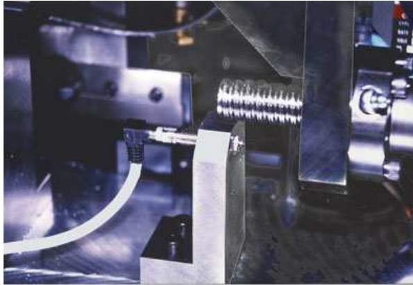
My-Com precision switch applied on an automatic turning lathe producing miniature metal parts

The turning worm-screw moves the metal target on the right side of the picture slowly towards the activating pin of the My-Com to the point of the device being activated thereby providing the exact home position of the mechanics which has to be re-calibrated within previously determined time intervals.